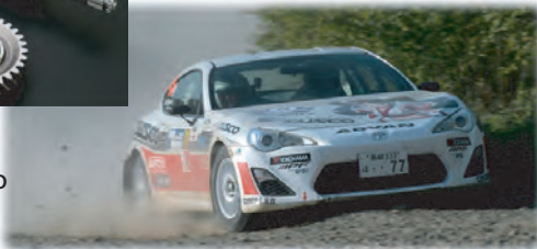
CUSCO ADVAN 86 2012 RALLY HOKKAIDO CLASS WINNER