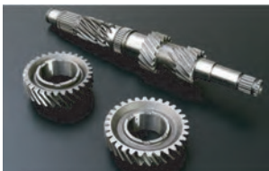
TOYOTA 86 & SUBARU BRZ 1ST & 2ND CLOSE RATIO GEARS

Real products will produce real results, only from Cusco.