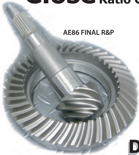
AE86 FINAL R&P