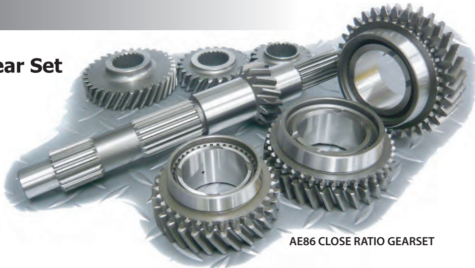
AE86 CLOSE RATIO GEARSET