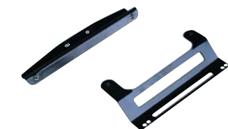
Diffuser attachment stay kit

By using this kit with Rear Frame Bar, you can add the rear under diffuser from latest GDB applied model F.