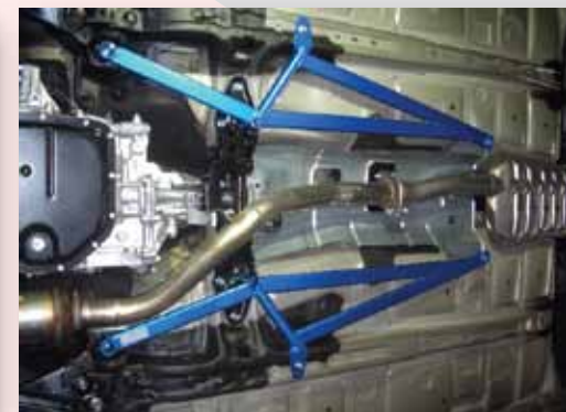
Powerbrace Floor Center (692 492 C) MSRP $507 (38,000 JPY)