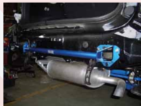
Powerbrace Rear End (687 492 RE) MSRP $227(17,000 JPY)