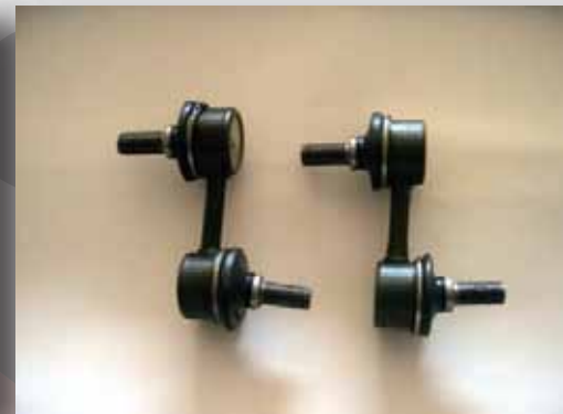
Strengthened End Link (667 318 A) MSRP $74 (5,500 JPY)