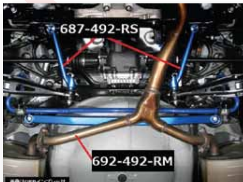
Powerbrace Rear Member Side (687 492 RS) MSRP $174 (13,000 JPY)