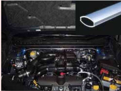
Front Strut Bar Type OS (694 540 A) MSRP $200 USD (15,000 JPY)